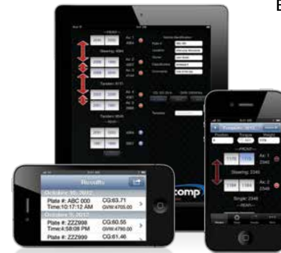
iVehicleWeigh™ - Ideal for Wheel & Axle Weighing iPhone®, iPod® & iPad® Sold Separately