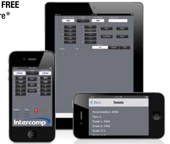
iExactWeigh™ - Versatile for Many Weighing Applications iPhone®, iPod® & iPad® Sold Separately