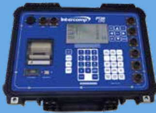
PT20™ Weighing CPU

Provides the ability to process weight-related data and is self-enclosed with a thermal printer in a rugged, all-weather case for use in even the most remote locations. Collect and totalize axle weight, gross weight, vehicle ID & class for reporting and data collection.