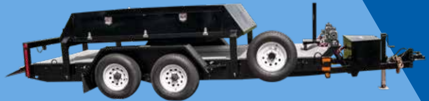
Optional Trailer for Easy Transportation to Enforcement Site

Provides the ability to process weight-related data and is self-enclosed with a thermal printer in a rugged, all-weather case for use in even the most remote locations. Collect and totalize axle weight, gross weight, vehicle ID & class for reporting and data collection.